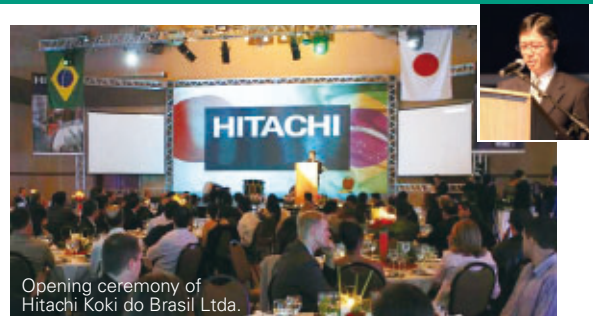
Opening ceremony of Hitachi Koki do Brasil Ltda.

In addition to its operations in Japan, the United States and Europe, Hitachi Koki is strengthening its sales capabilities to develop new customers and promote product sales in emerging nations. Following its entry into Russia, India and China, Hitachi Koki has established a new base in Brazil to make a full-fledged entry into the market there.