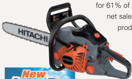
Chain saw with Hitachi Koki's original New Pure Fire low-emission engine

In fiscal 2010, Eco-products accounted for 61% of Hitachi Koki's consolidated net sales, and 85% of all new products.