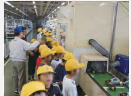
Elementary school students from Hitachinaka City on a company study tour view the final stage of product manufacturing.

The entire Hitachi Koki Group will continue to promote environmental protection and social contribution activities.